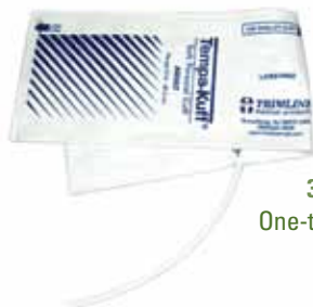
39004 One-tube Adult