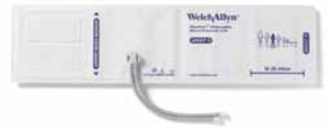
FlexiPort Soft Disposable Blood Pressure Cuffs with Two-Tube Screw-Type Connector