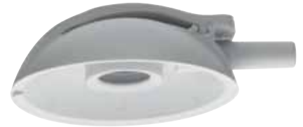
5082-257 Integrated Gauge Adapter