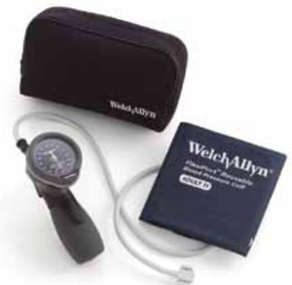
5098-27 Trigger Aneroid with Adult FlexiPort® Cuff and Nylon Zipper Case