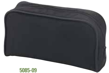
5085-09 Storage Case, Vinyl