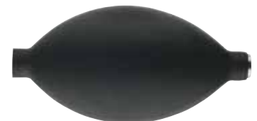
5086-01 Large Inflation Bulb