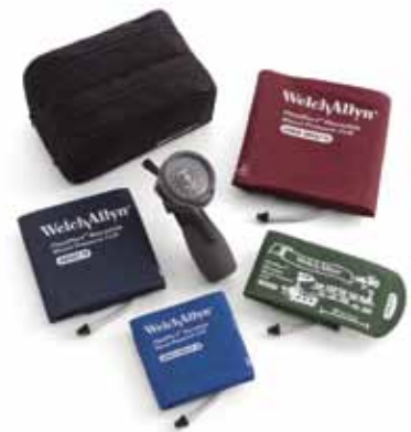
5098-30 Gauge and Multi-FlexiPort Cuff Kit, Small Adult, Adult and Large Adult FlexiPort® Cuffs and Nylon Zipper Case