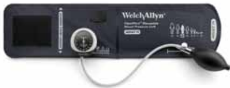
DS45-11 Gauge with Adult Cuff