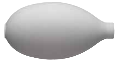
5086-08 Bulb, Standard, Gray, Medium