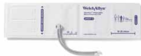
FlexiPort Vinyl Disposable Blood Pressure Cuffs with Two-tube Screw Type Connector