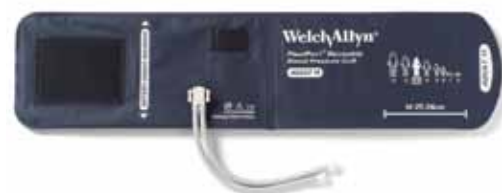
FlexiPort® Adult Reusable Blood Pressure Cuff with Two-Tube Screw-Type Connector