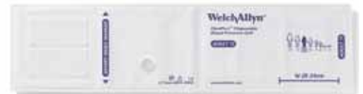
FlexiPort® Vinyl Disposable Blood Pressure Cuff (no tubes or connectors)