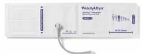
FlexiPort® Soft Disposable Blood Pressure Cuffs, One-Tube Screw-Type Connector