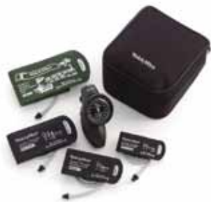
DS58-PD Gauge with Pediatric FlexiPort® Cuff Kit

DS58 Gauge Only (NEW replacement for 5098-03)