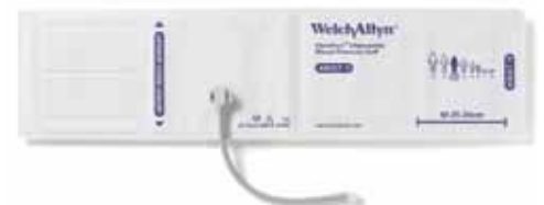
FlexiPort® Vinyl Disposable Blood Pressure Cuffs, One-Tube Screw-Type Connector