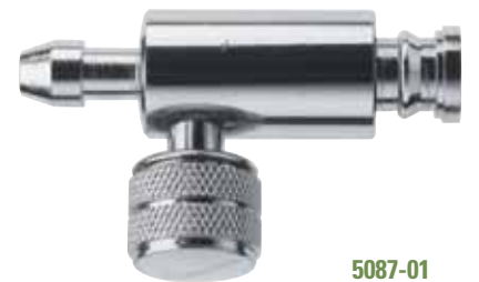
5087-01 Air Release Valve