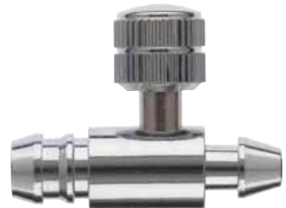
5087-16 Air Release Valve, Standard