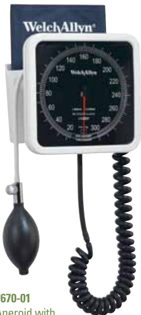
7670-01 Wall Aneroid with Adult Cuff