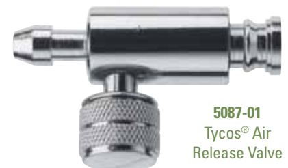
5087-01 Tycos® Air Release Valve