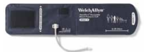
FlexiPort® Adult Reusable Blood Pressure Cuff with One-Tube Screw-Type Connector