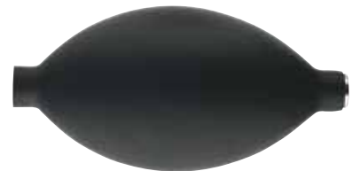
5086-03 Premium Large Inflation Bulb (black)