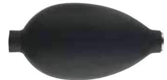
5086-03 Small Inflation Bulb