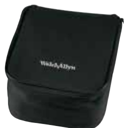
5085-10 Small Nylon Zipper Case