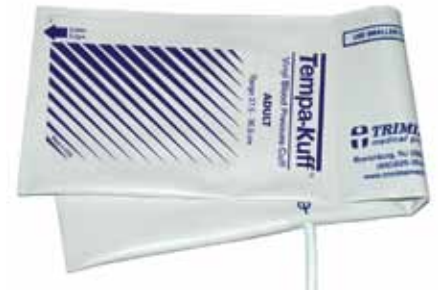
99859 One-Tube Adult