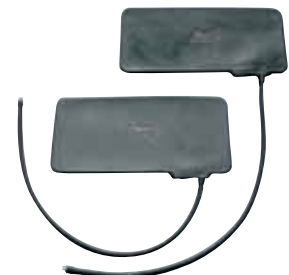
5089-03 Black Neoprene Adult Inflation Bladder

5089-18 Black Neoprene Thigh Inflation Bladder