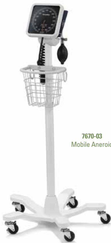
7670-03 Mobile Aneroid

7670-03 767 Mobile Aneroid with Reusable FlexiPort Adult Cuff