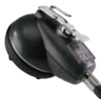
DS48A Gauge only