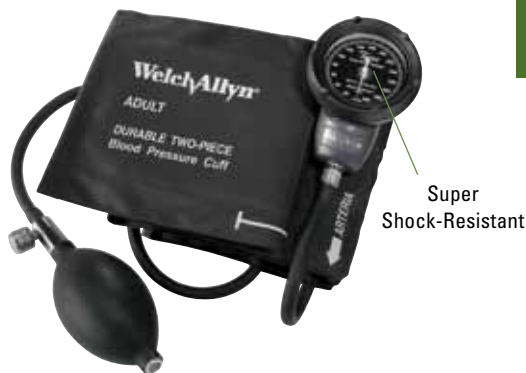
DS48-11CB Gauge with Adult Cuff