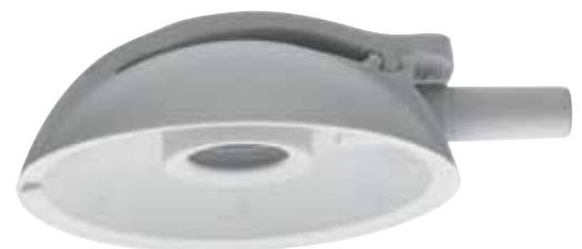
5082-257 Integrated Gauge Adapter