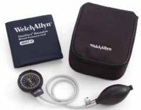
DS48 -11 DS48 Gauge with Adult Cuff and Case