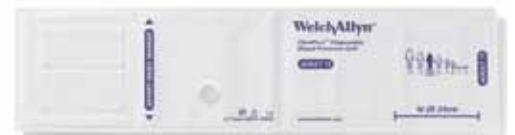
FlexiPort® Soft Disposable Blood Pressure Cuff (no tubes or connectors)