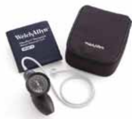
DS58-11 Gauge with FlexiPort® Adult Cuff