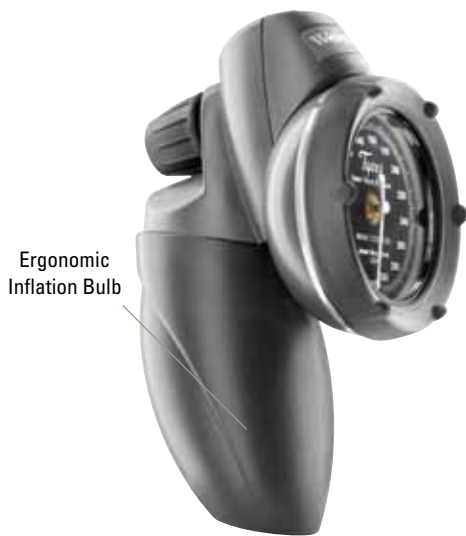
Ergonomic Inflation Bulb