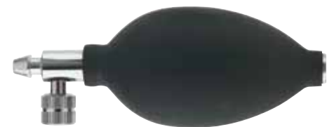
5088-01 Small Inflation Bulb and Air-Release Valve

5087-01 Blood Pressure Air-Release Valve