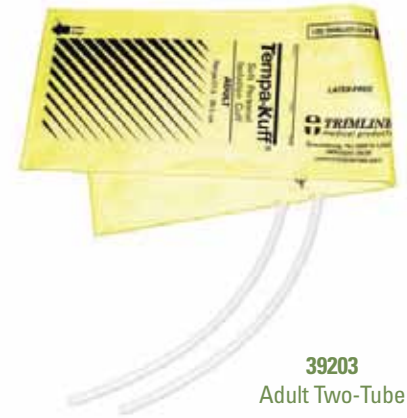
39203 Adult Two-Tube