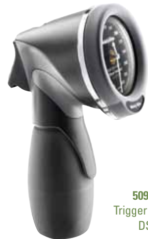
5098-31 Trigger Aneroid DS66

5082-44 Large Adult Blood Pressure Cuff and One-Tube Bladder