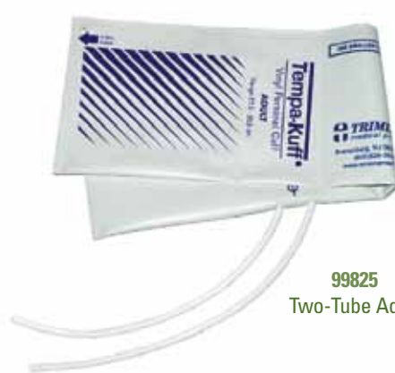
99825 Two-Tube Adult