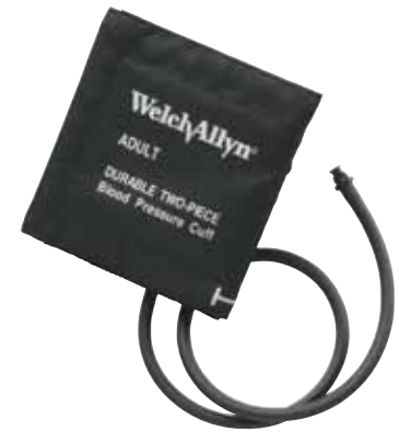
5082-43 Adult Blood Pressure Cuff and One-Tube Bladder

5082-77 Thigh Blood Pressure Cuff and One-Tube Bladder