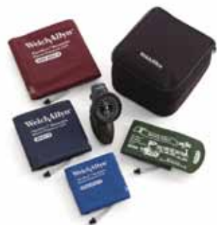
DS58-MC Gauge with FlexiPort® Family Practice Kit