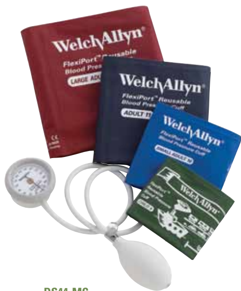
DS44-MC DuraShock Multi-FlexiPort Cuff Kit