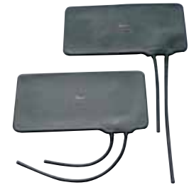
5089-01 Black Neoprene Adult Inflation Bladder

5089-19 Black Neoprene Thigh Inflation Bladder