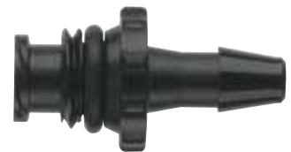
5082-200 Blood Pressure Connector (Tri-Purpose Type)